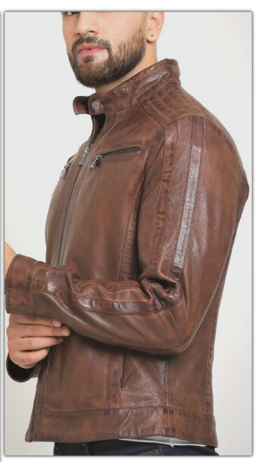
LAMB WASHED MUMBAI