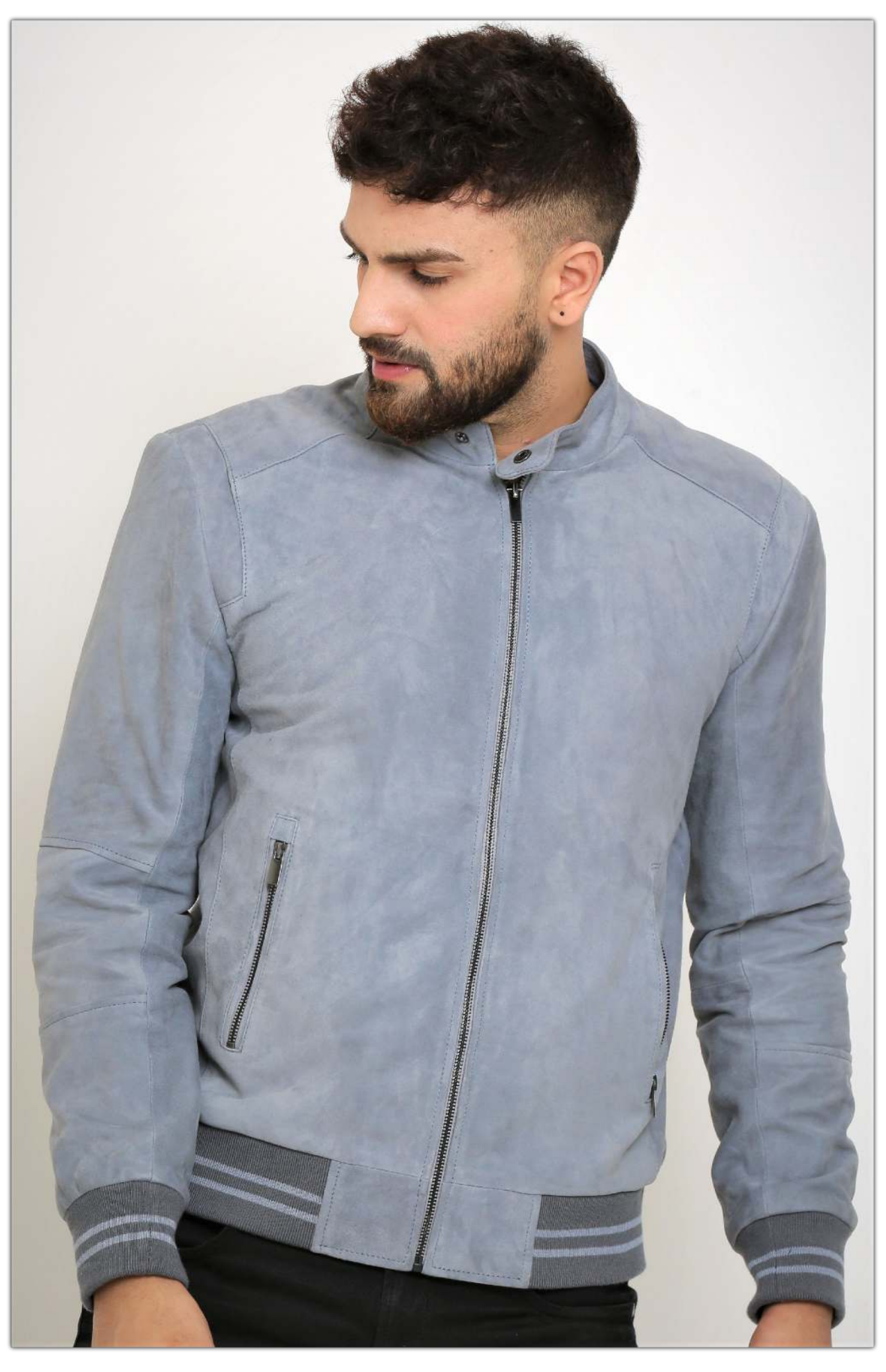
SOUL SUEDE GREY