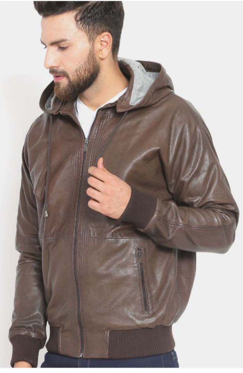
NON REMOVABLE HOOD