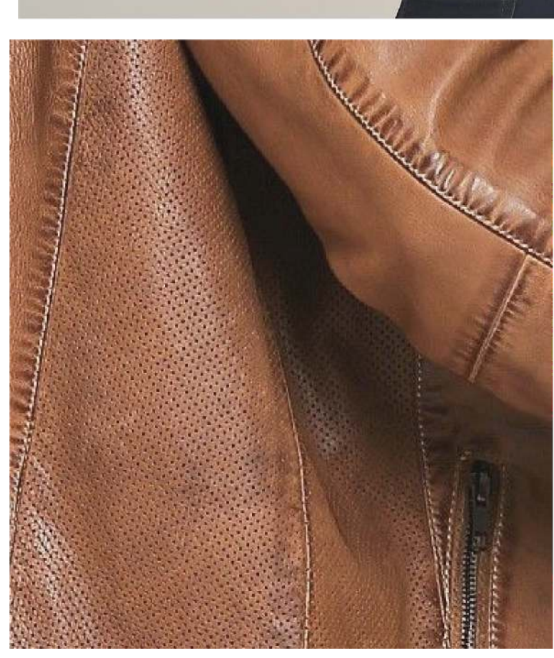
BLAKE WASHED COGNAC